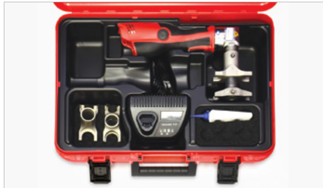
Veltanium Tool Kit 16-32