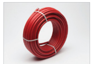
Red - Water Pipe Coil