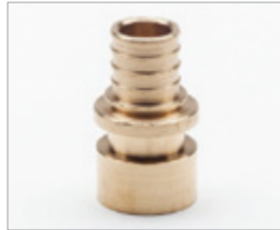
Copper Brazing Tail