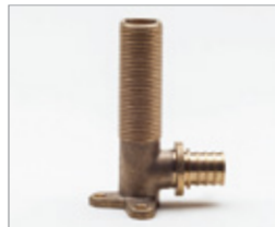
Male Lugged Elbow