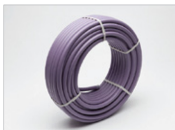
Lilac - Water Pipe Coil