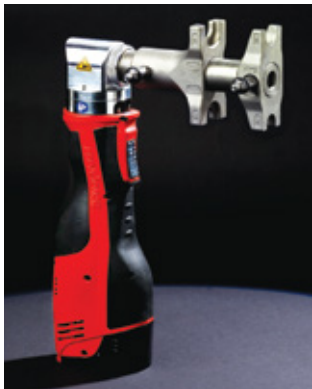
Axial Pressing Tool AAP102