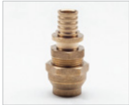
Copper Flared Adapter

VELTANIUM connection fittings are formed from the highest quality brass, for systems 16-32 mm. Materials remain the superior choice for the most failsafe, high-performance system.