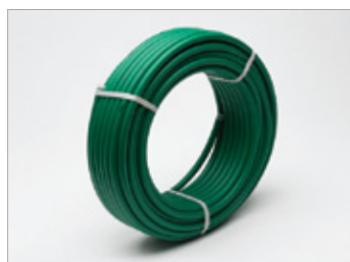
Green - Water Pipe Coil