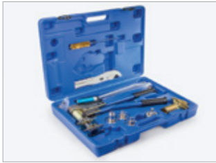
Veltanium Tool Kit