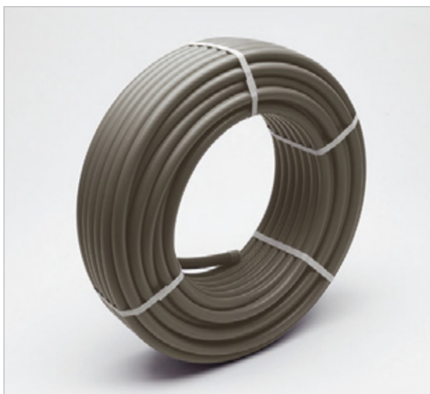
Titanium - Water Pipe Coil

VELTANIUM compression piping comes in a range of colours, to define needs, with our signature titanium pipe being the choice for hot and cold water.