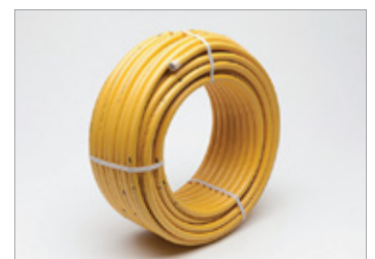
Yellow - Gas Pipe Coil