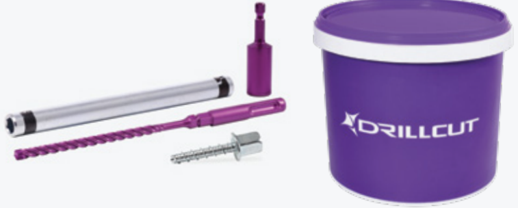
Female Drillcutta - Bucket