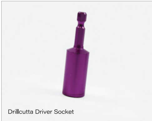
Drillcutta Driver Socket