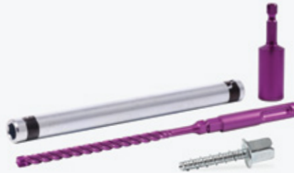
Female Drillcutta - Bucket