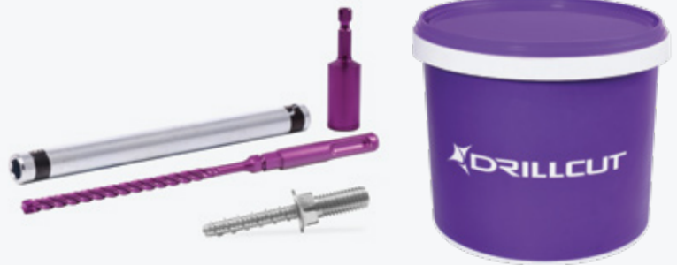
Male Drillcutta - Bucket