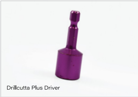
Drillcutta Plus Driver