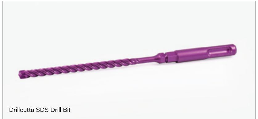
Drillcutta SDS Drill Bit

For more information on our complete list of products contact sales@drillcut.com.au or phone 1800 DRILLCUT (374 552)