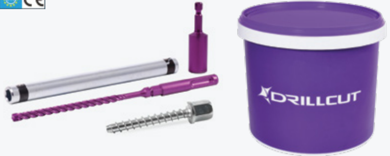
Female Drillcutta Plus - Bucket