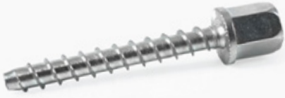
M10 Female Drillcutta Plus