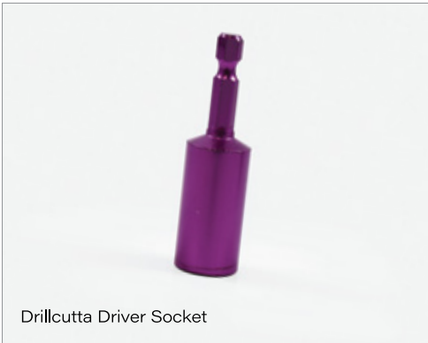
Drillcutta Driver Socket